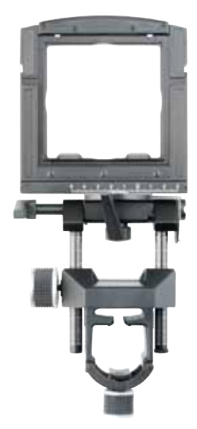
Multipurpose Standard 100