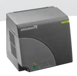
Sinar eVolution 75H