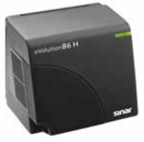
Sinar eVolution 86H