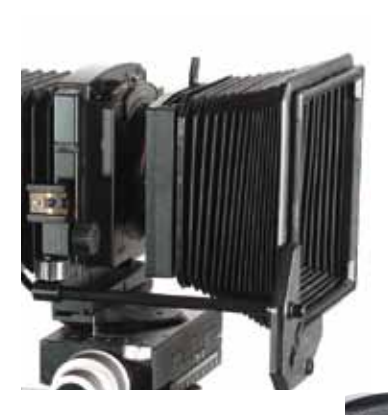
Lens Hood with Bellows