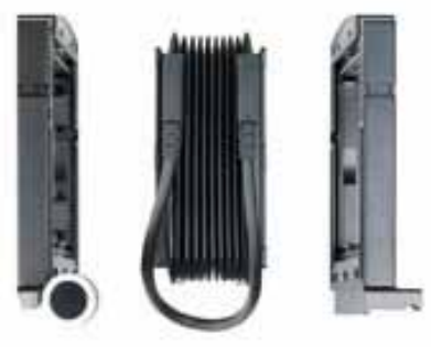
Conversion Set Sinar p2/p3